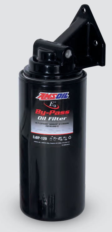
Fittings and hardware not shown

The Heavy-Duty Bypass Filtration System is constructed of high-quality cast aluminum with a steel filter spud that has been thoroughly tested in on-road and severe off-road service. The mount is finished with a thick layer of powder-coated paint to provide maximum resistance to the degrading effects of road salt, debris and engine-compartment chemicals.