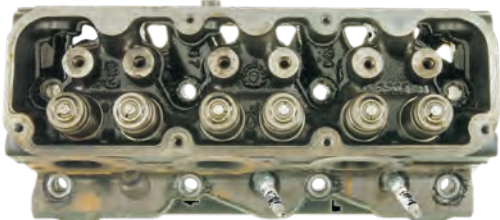
Cylinder head after cleanup with AMSOIL Engine and Transmission Flush. The valve springs and push rod openings are noticeably cleaner, with fewer sludge deposits. The manufacturer's stamping is more easily seen.