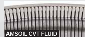
AMSOIL CVT FLUID