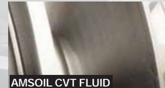
AMSOIL CVT FLUID