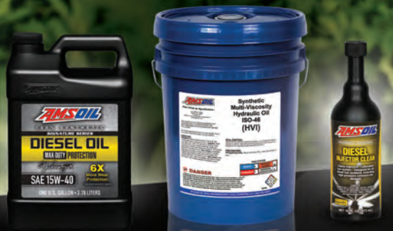
SYNTHETIC DIESEL OIL