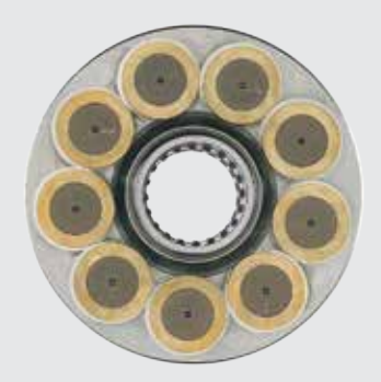
YELLOW METAL PISTON SHOES

After 608 hours of strenuous pump testing in a Parker Hannifin (Denison) T6H20C Hybrid pump, the piston shoes demonstrated only moderate polishing and trace, random scratches, proving AMSOIL Synthetic Multi-Viscosity Hydraulic Oil excels at protecting yellow metals. The vane pump cam ring exhibited only light polishing and trace scratching, further confirming the excellent wear protection provided by the oil.