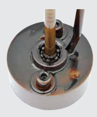
LEADING CONVENTIONAL HYDRAULIC FLUID (ISO 46)