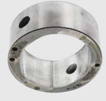
VANE PUMP CAM RING