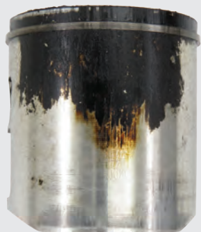
Leading Oil Brand 300 Hours