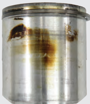
AMSOIL SABER Professional 300 Hours

Following 300 hours of professional-use testing in STIHL* string trimmers at the manufacturer mix ratio of 50:1, SABER Professional kept pistons and rings virtually free of carbon and wear (see the picture on the top), while use of a leading oil brand caused significant carbon buildup around the ring area (see the picture on the bottom). This engine is nearing the failure point.