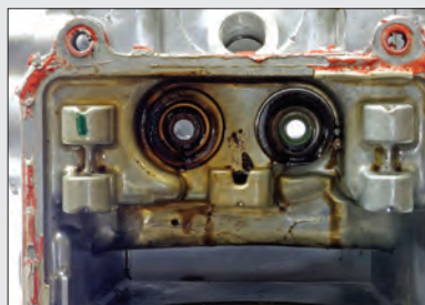
AMSOIL 10W-30 Synthetic Small Engine Oil 125 Hours

Following 125 hours of severe-service testing in a Honda* 5-hp engine, 10W-30 Synthetic Small Engine Oil kept the valve guides in the engine pictured on top clean and functional. In contrast, using a leading oil brand, the engine pictured on bottom failed due to exhaust valve sticking. During engine disassembly, heavy deposits prevented test administrators from removing the valve.