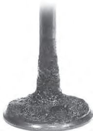
Intake Valve before P.i. Treatment